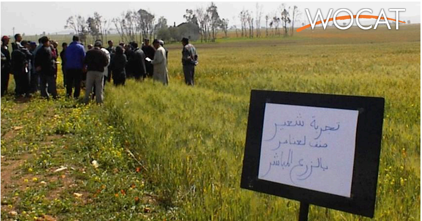
No-till field day in Benahmed region. The sign says: Trial with barley, direct seeding