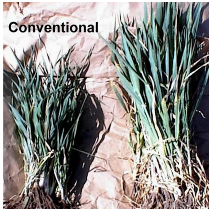
Barley samples from on-farm plots at Khourigba, showing improved growth under no-till technology compared with conventional farming.

The Approach focused mainly on SLM with other activities