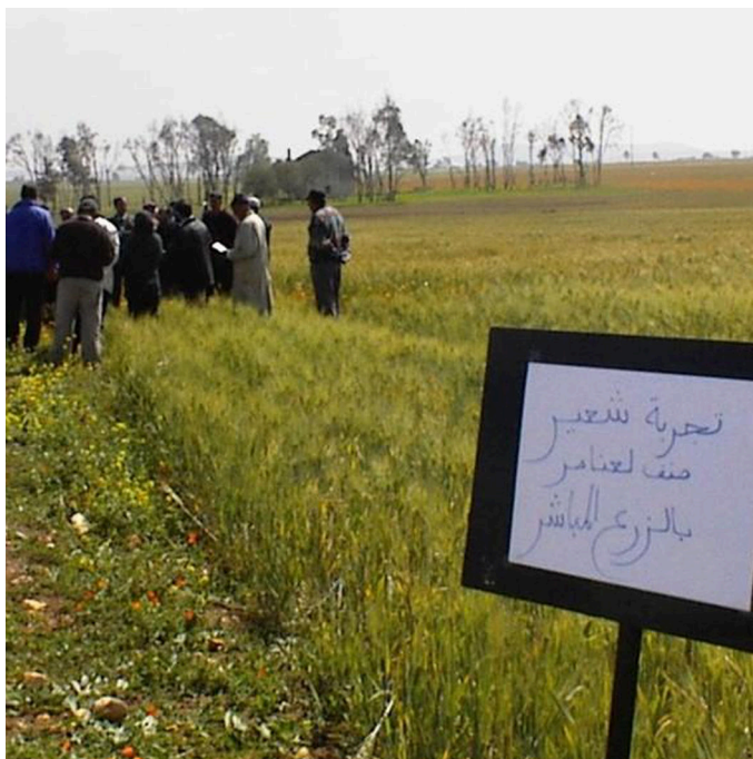
No-till field day in Benahmed region. The sign says: Trial with barley, direct seeding