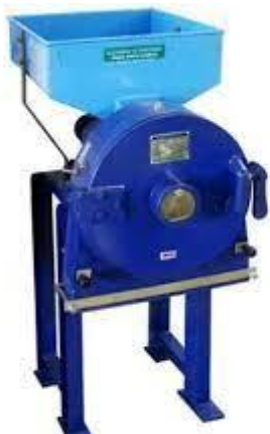
Pulverizer used for pulverization of Charcoal into powder.