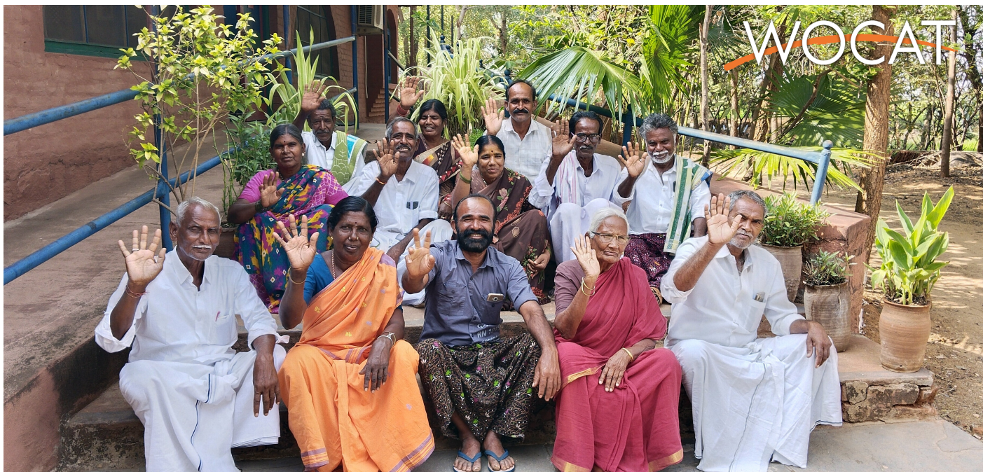
Community Directors of the Kalpavalli Cooperative at their monthly meeting