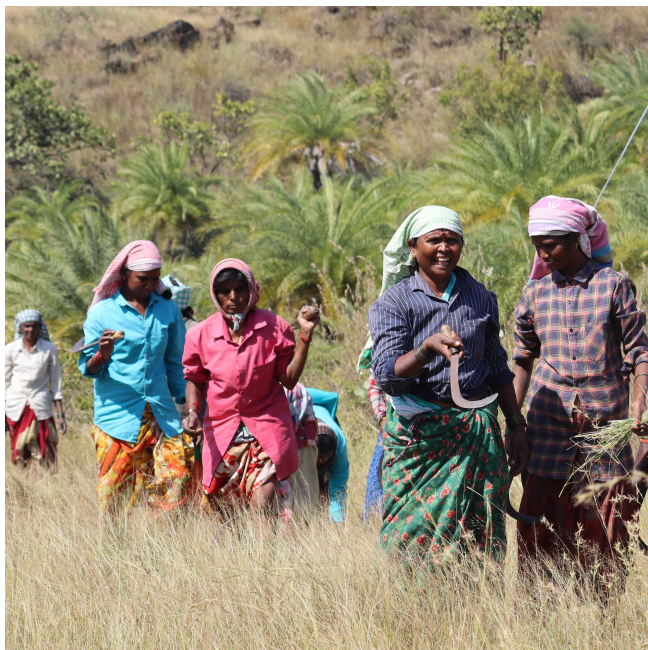
Women community members engaged in seasonal collection of fodder, thatch and broom grass from the conservation area. (Timbaktu Collective)

Trees and vegetation: Initial attempts at using nurseries for propagation met with little success - and were replaced by seed broadcasting and propagation of local wild species. Seed huts were built to store seeds gathered from this indigenous vegetation.