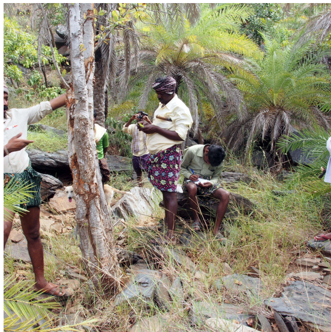
Community forest watchers during a training session on research methods in the conservation area (siddharth rao)