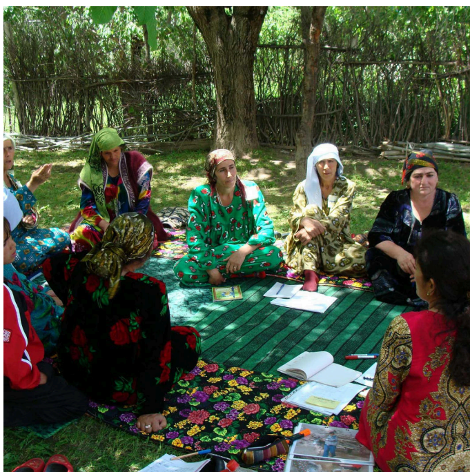
Workshop on Energy Efficiency Use and Cooking Stove Modification (Odinashoev, Sa (Tajikistan, Muminabad))