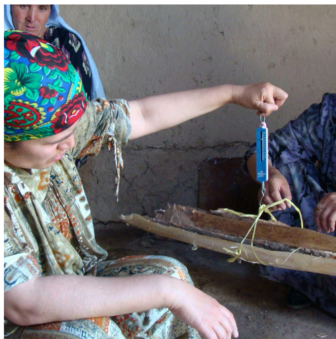
Women weighing the amount of wood that was saved after the modification of cooking stove. (Odinashoev, Sa (Muminabad, Tajikistan))