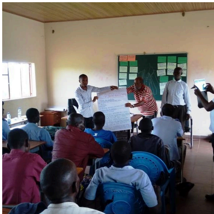
Presentation of the final grazing management plan for the Commune of Impulo (Projecto RETESA 2017)