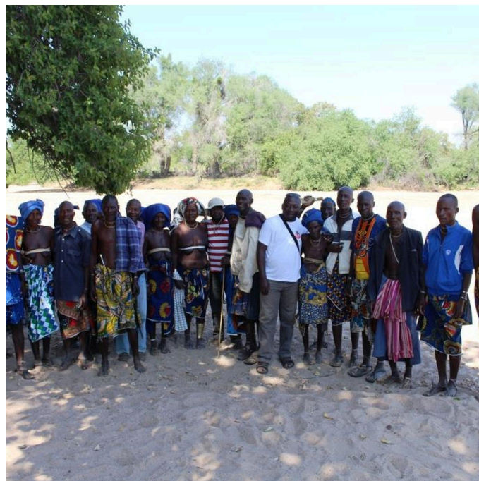
Celebration of a Jango pastoril in the Community of Cavelocamue, Virei (Projecto RETESA 2017)