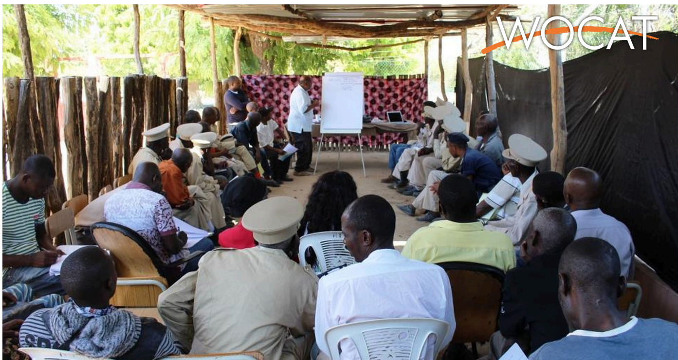
Celebration of the 4th Lola Commune Jango Pastoril (Pastoral Management Forum), hosting Commune Administrators and technicians, traditional leaders, veterinarians and herders for discussions on land and animal management.